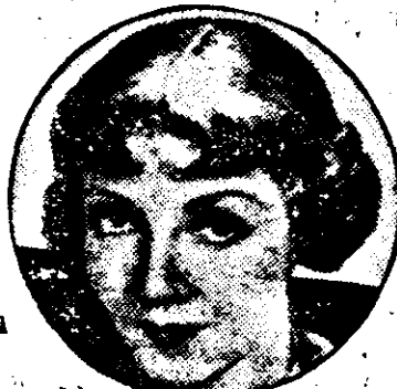
CLAUDETTE COLBERT Guest of Honor